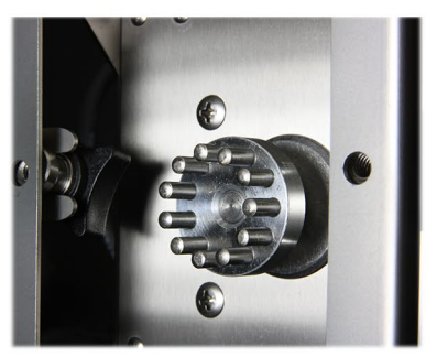
VITO 80 - The world's best in-tank pressure oil filtration system! VITO 80 is suitable for all fryers upwards from 10I (18 lbs).